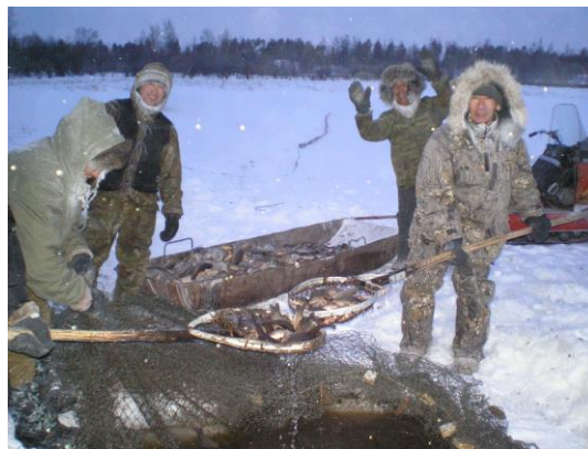
Traditional winter seine fishing in Yakutia (Russia)

In some Arctic regions the term local ecological knowledge is often used. Traditional or local knowledge systems can be divided into several interrelated components. Central to this is local knowledge of resources and resource management systems including practices, tools and techniques. Often this includes knowledge of social institutions ("rules-in-use"), principles of social relations and a worldview enriched by the concepts of religion, ethics and broader belief systems. For many Indigenous populations customary practices and a profound sense of the sacred fill everyday life.